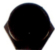
PS-3S Electrode Holder